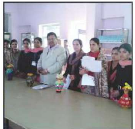
Pot Decoration Competition