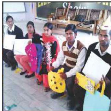
Paper Folding & Cutting Competition