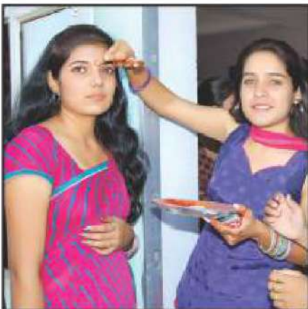
Welcome of Guests